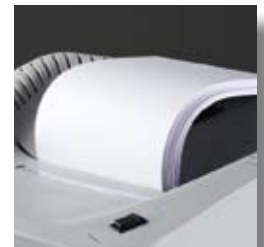
High efficiency cutting knives allow impressive shredding capacity