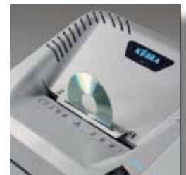
Automatic Start/Stop through electronic eyes. Integrated flap for CDs, DVDs, Floppy Disks and Credit Cards shredding