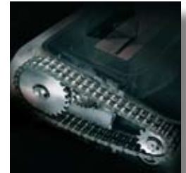
Heavy duty chain drive with steel gears