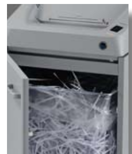
High volume 135 litre cabinet