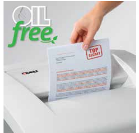
Shredding the convenient way, all without the time-consuming process of oiling the cutters