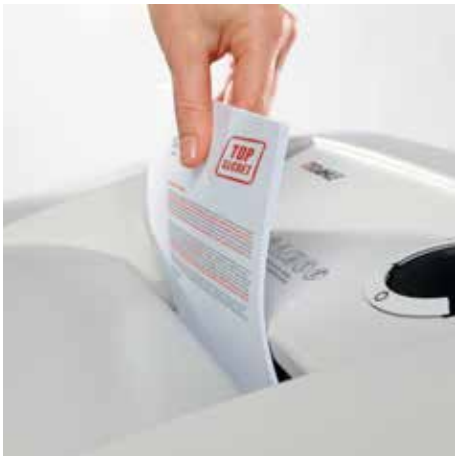
Innovative MHP technology® shreds up to 30 % more paper