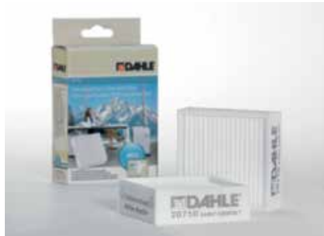
Fine particle filters Dahle 20710