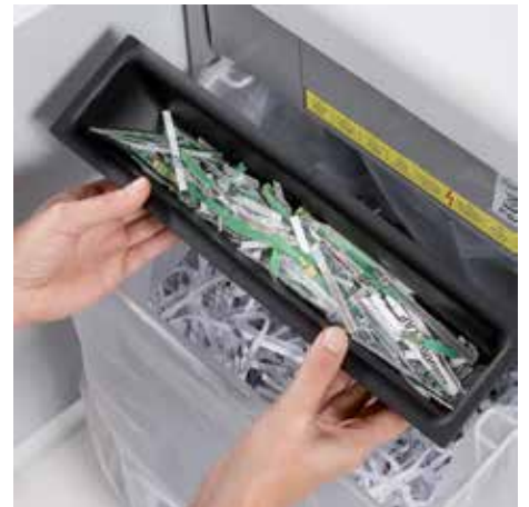
Separate, integrated waste boxes help to sort shredded paper, CDs, DVDs, cheque and credit cards for eco-friendly recycling