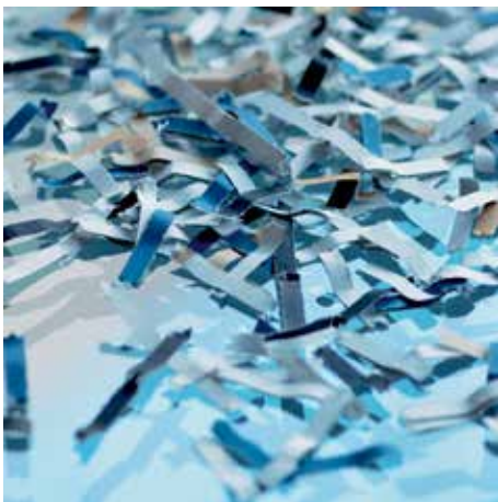
P-4 security: recommended, for example, for data media containing particularly sensitive, confidential and personal data