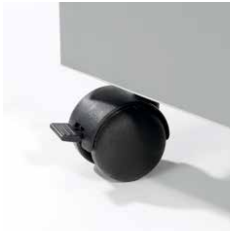
Practical swivel casters for flexible use